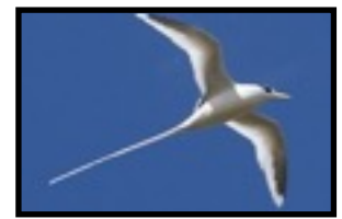
October 9th 2020 Reunion Island