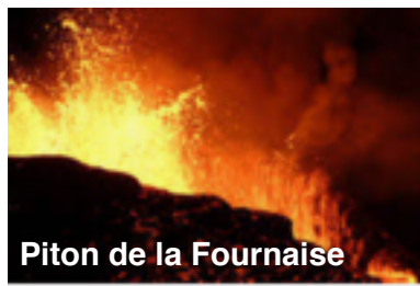
Piton de la Fournaise